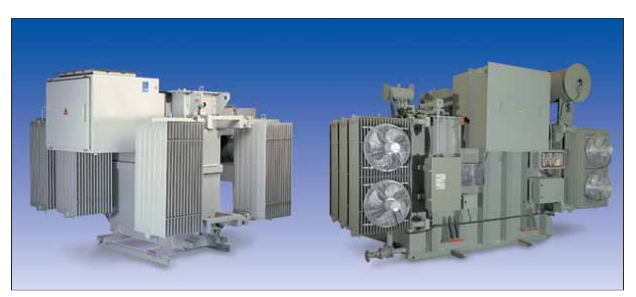
• 6.25 MVA – 11/ 11 kV Power Transformer

With the combination of high grade material, reliable manufacturing processes and top quality workmanship only transformers with the highest quality are produced.