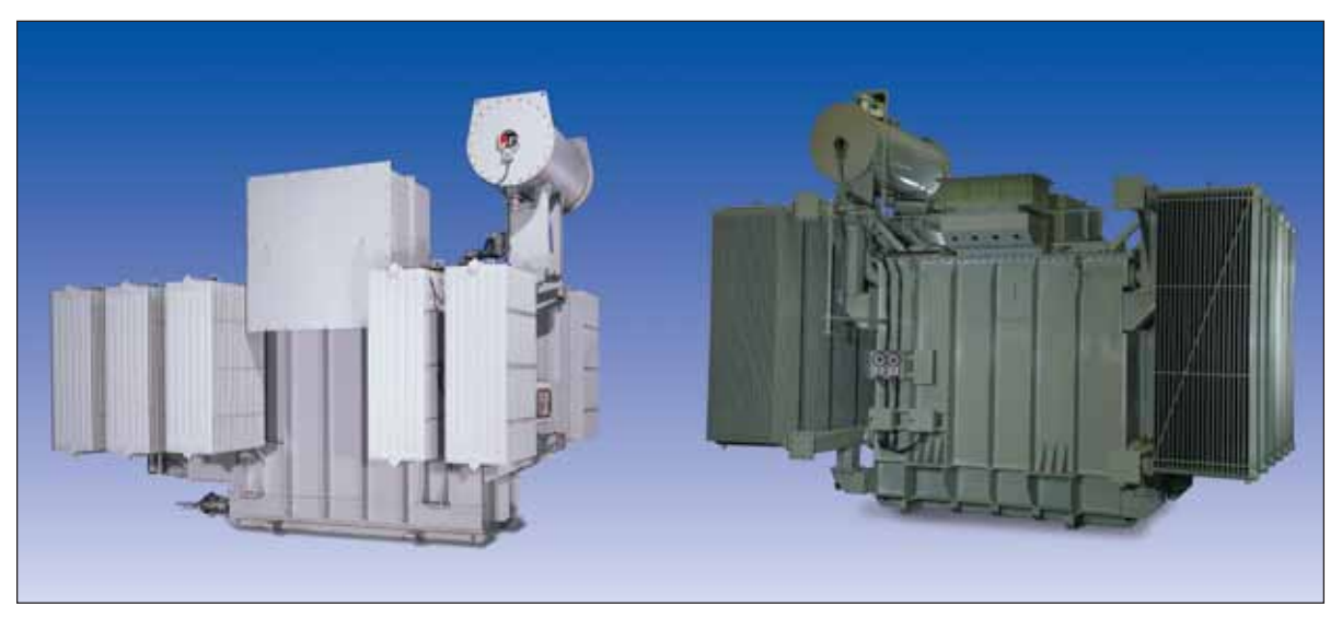
• 15 MVA – 33/11 kV Power Transformer

• 30 MVA – 69/ 13.8 kV Power Transformer